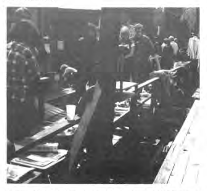
Shoppers take advantage of a break in the clouds at 2025 Fairview's rummage sale,