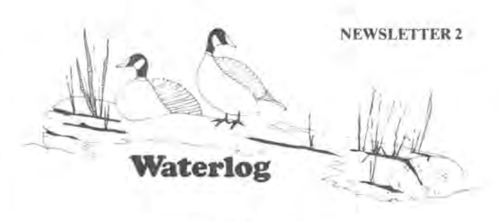
by Sheri Lockwood

The introduction of backflow preventers into the floating homes community is a welcome one. Despite some problems and adjustments, the benefits derived from safeguarding the purity of our water supply can be appreciated and enjoyed by all.